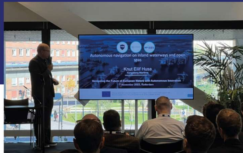
Figure 6: Knut Eilif Husa