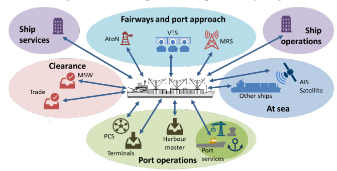
Figure 2. The Proposed Maritime ITS Domain [from [17]]

The domain of Maritime ITS is not fully defined yet, but the preliminary definition is that it at least should include the ship and the entities that are directly interacting with the ship as exemplified by Figure 2.