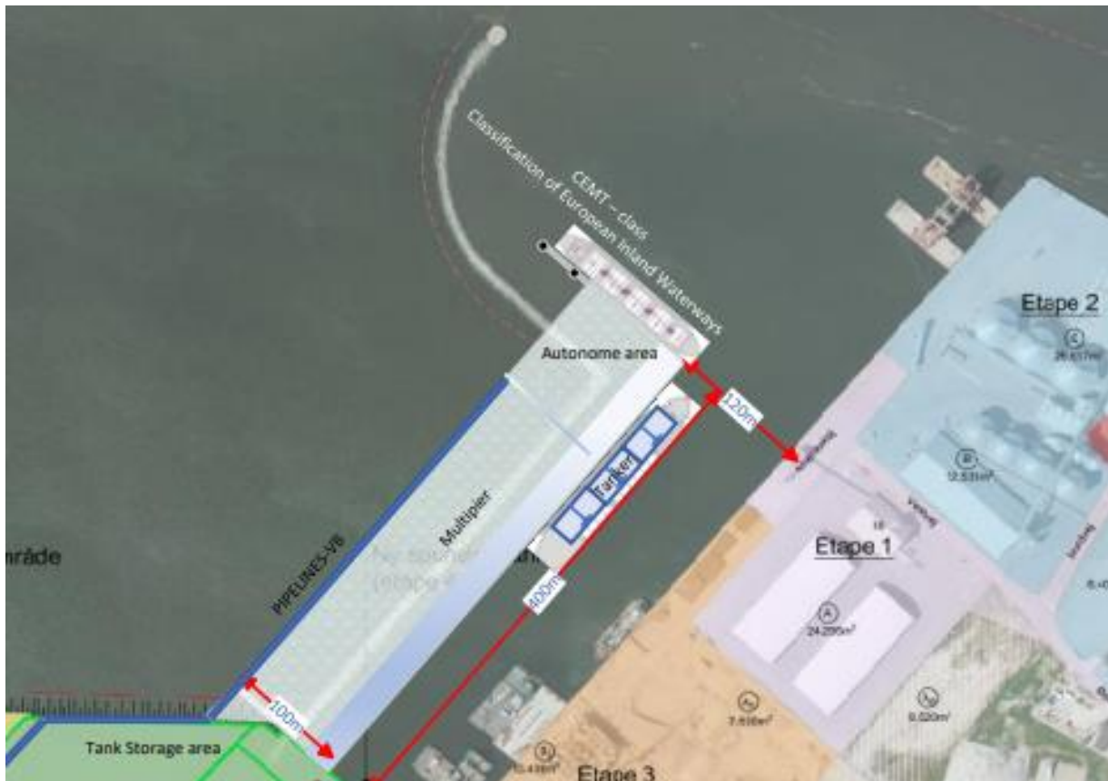
Figure 4 – Port of Vordingborg multiuse pier for autonomous bulk carriers

With respect to the autonomy calls to port, and the issue of congestion and communication, Port of Vordingborg understands that a communication procedure / platform should be developed to, for example, give warnings in times of congestion. This will have influence and/or conflict with the terms in the charterparty. Since the ships master legally has to confirm “notice of arrival”, how is this aspect dealt with, when the ship arrives autonomous. A legal matter that has to be solved in the terms of the charter party and Bill of Lading.