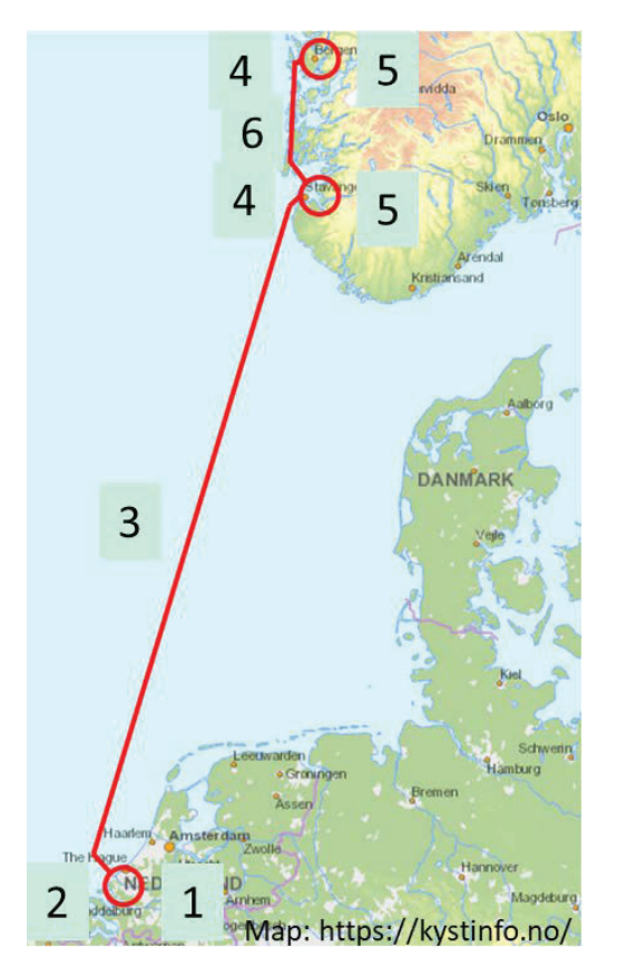
Figure 2. Example route

We can then consider two realizations of this example. One is a crewed vessel where autonomous control is used onboard to assist crew and to allow them to go to sleep during sea passage at night-time. The second is an uncrewed ship with supervision from a continuously manned RCC.